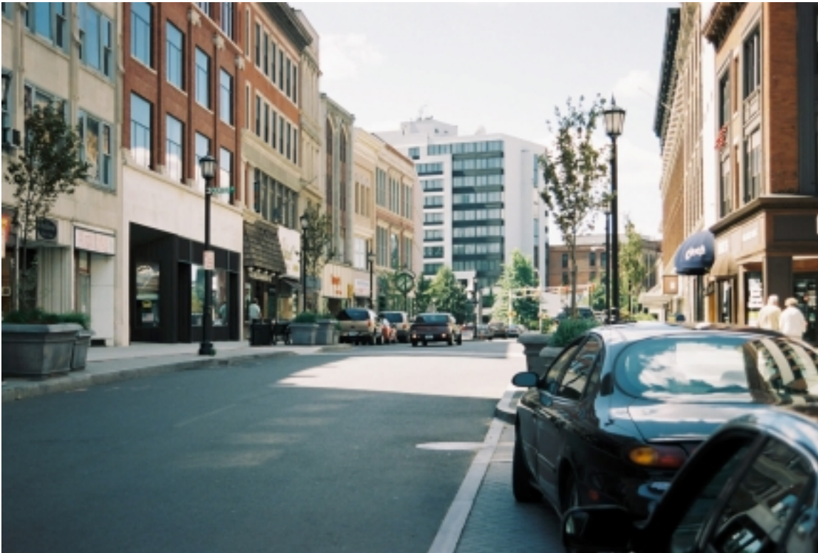
Figure 4. Example of the lighting on a downtown street in Connecticut.

The appearance of a space (during nighttime as well as daytime) is an important consideration for many areas, especially in historic areas where the lighting system not only illuminates roadways and sidewalks, but can also help draw attention to architecture and other aesthetic features such as parks, statues and other public areas. The appearance of the luminaire itself is often selected to harmonize with its surroundings. In addition, factors such as color appearance might be important. Leslie (1996) found that one's ability to identify colors is reduced with high pressure sodium illumination at light levels below 1 footcandle, while metal halide, fluorescent and incandescent lamps provide good color identification even at one-tenth this light level. This could be important for identifying one's parked car, for example.