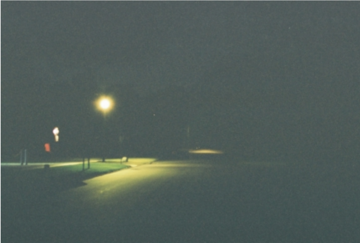
Figure 3. Example of the lighting on a residential street in Connecticut.