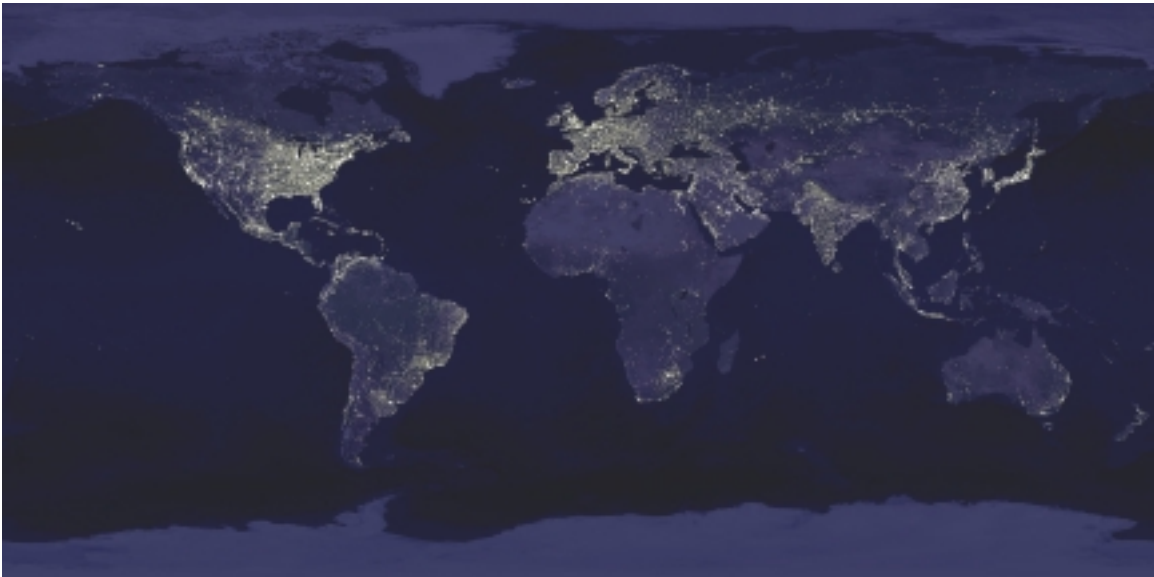
Figure 1. Credit: Data and image processing by NOAA's National Geophysical Data Center. DMSP data collected by US Air Force Weather Agency.

Light pollution is an unwanted consequence of outdoor lighting and includes such effects as sky glow, light trespass, and glare. Sky glow is the brightening of the sky due to outdoor lighting and is usually objected to because it inhibits one’s ability to see and appreciate the stars. A large amount of light and energy is wasted as a result of outdoor lighting. This fact is illustrated in Figure 1. Light trespass is light falling where it is not wanted or needed. Light from a streetlight or a neighbor’s floodlight that illuminates your bedroom at night is an example. Glare is excessive brightness causing discomfort or visual disability and a good example is an unshielded luminaire where the lamp can be directly seen.